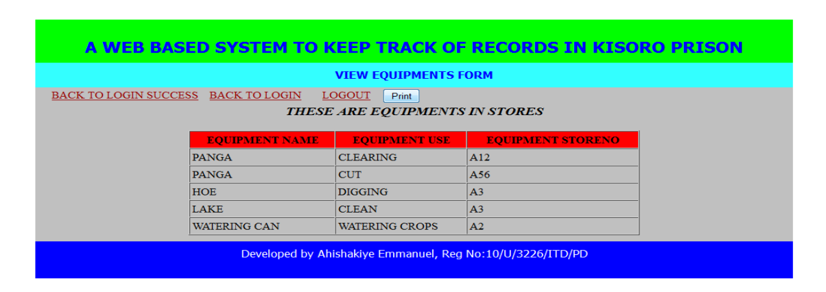
Figure 6: view the available prison Equipment

All these forms are represented by the view equipments form. This form acts as a report and it is essential to view all the information about the equipments that is available in the system database. The fig below shows the report of the equipments that are available in Kisoro prison.