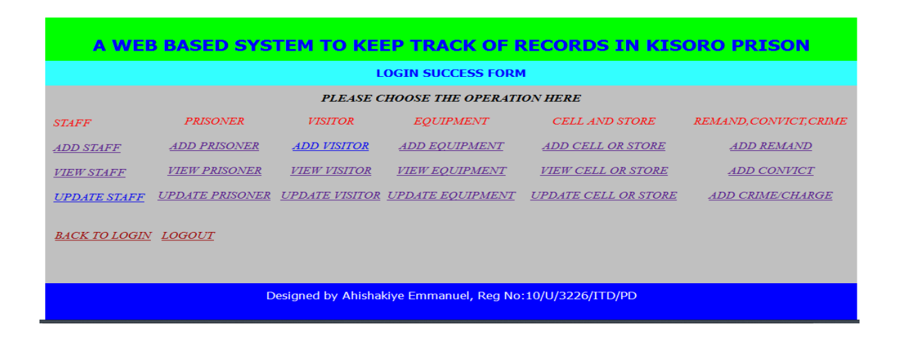
Figure 4: operations after successful login

When the user in puts correct username and password in the login form, login success form is displayed, this contains all the system manipulations that is to say CRUD which means Create or Add information, Read or View information, Update or Edit information and Delete information. Fig below is a log in success form.