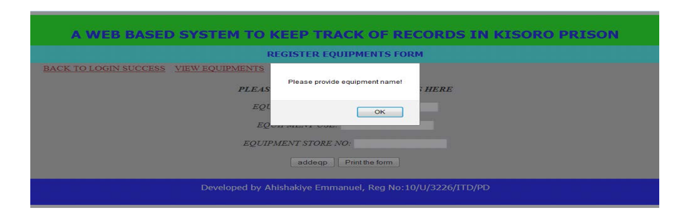
Figure 8: JavaScript system verification

All the forms for registering information have JavaScript which does not allow to submit empty forms, that is to say all the fields must be filled first in order for the form to submit data to the database. The figure below illustrates an example.