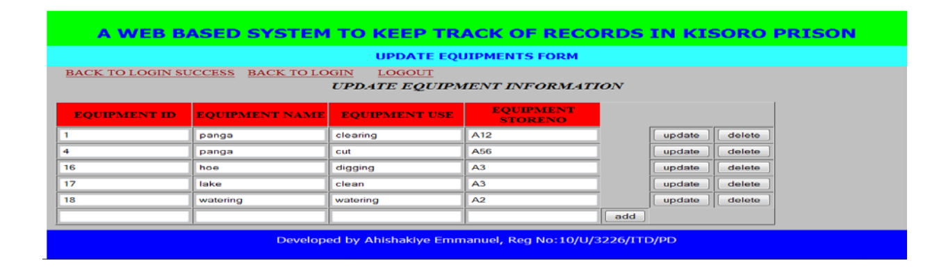
Figure 7: Update Equipment operation

update visitor form and update prisoner form. These forms have the fields that are necessary to updating the required information from system database. All these forms are represented by the update equipments form. This form contains all the system manipulations for the form. These include update or edit, delete and add. This form enables the storage of well organized data or information in the database. The fig below shows updates equipment form with all necessary manipulations.