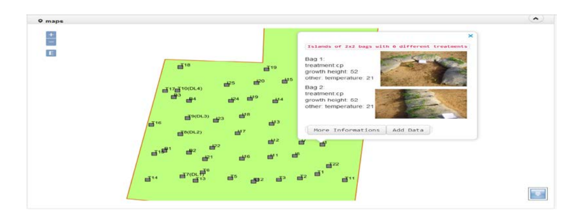
Figure 2: The geo-referenced ReviTec site

First step: The application processes data visualization of a point on the map starts by clicking on a bag on the map. When the user moves the mouse pointer on a bag or click on it a tooltip appear. The result is displayed in Figure 3.