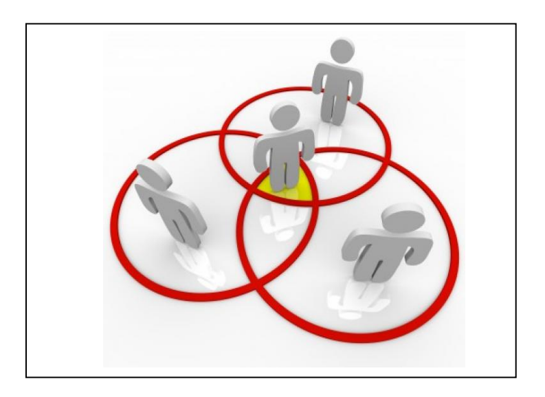
Fig.1. Silo Effect [5]

and at the same time can create a bad silo. It keeps people away from each other where they do not meet face to face to discuss the organization progress or success or even future challenges or constraints. Silo effect "refers to a lack of information flowing between groups or parts of an organization [5]." The following figure shows how people work in the same organization, but do not see each other or even communicate with one another about their projects and goals which at the end create silos between them.